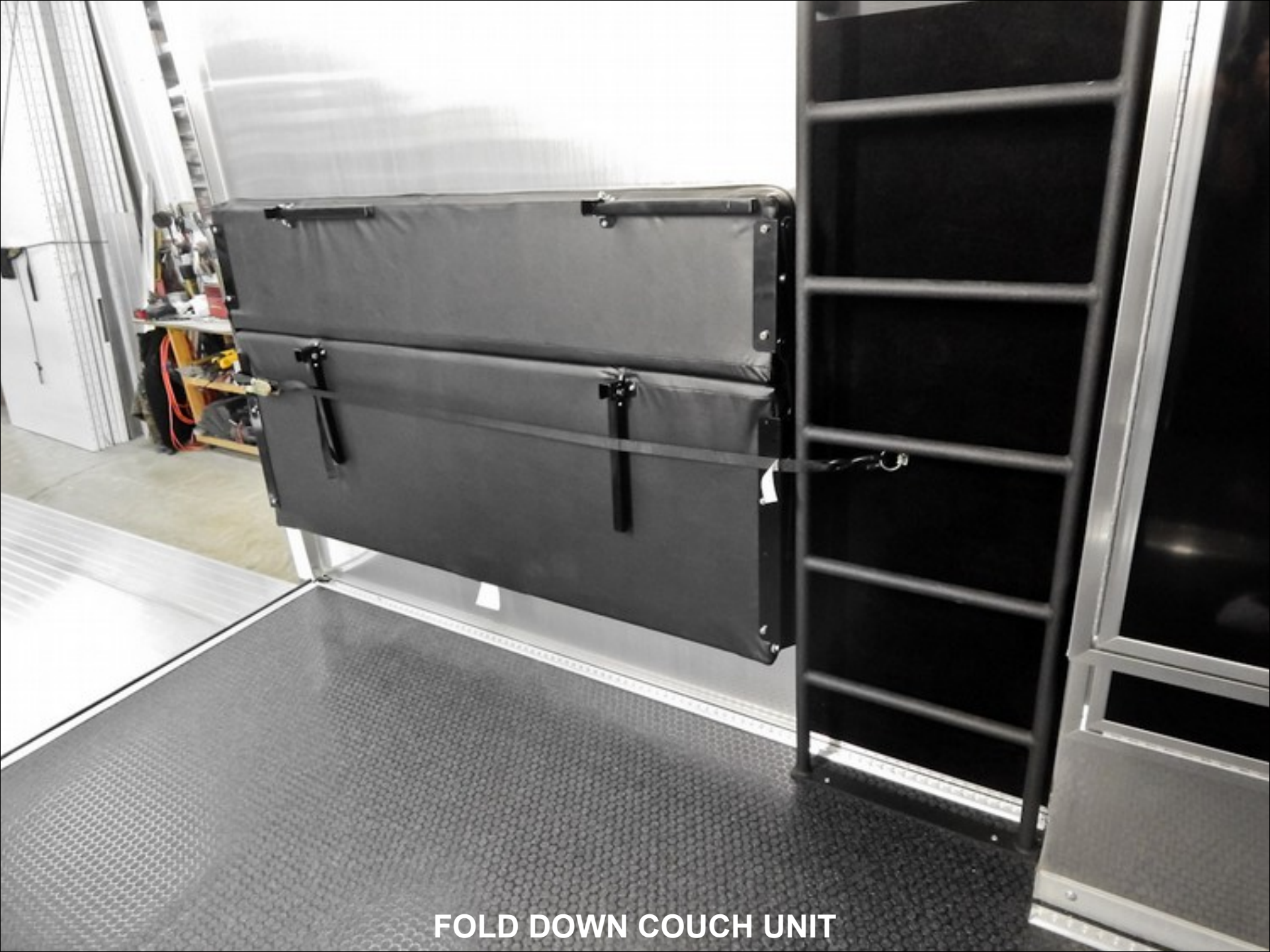
FOLD DOWN COUCH UNIT